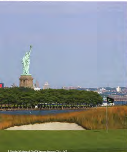
Liberty National Golf Course Jersey City, NJ