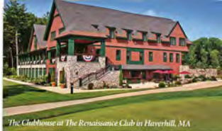
The Clubhouse at The Renaissance Club in Haverhill, MA

At Meredith Bay, buyers choose between lakeview lots, many with