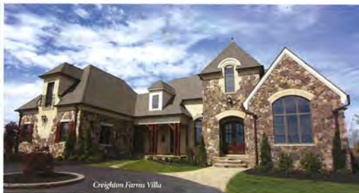
Creighton Farms Villa