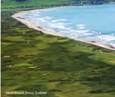
Machrihanish Dunes, Scotland

spectacular views, and lakefront townhomes, whose decks overlook the lake below and the White Mountains in the distance. Lake Winnepesaukee has long been one of New England's favorite summer destinations, and the Southworth community at Meredith Bay gives buyers a four-season home base from which to enjoy all that the region has to offer.