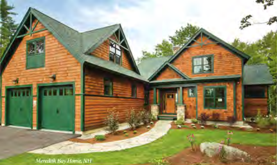
Meredith Bay Home, NH