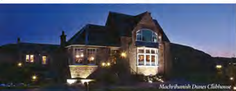
Machrihanish Dunes Clubhouse

brisk and got even brisker after Southworth assumed control of the community. The single-family homes, villas and townhomes are in high demand with people looking to enjoy an all-inclusive summer lifestyle.