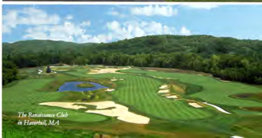
The Renaissance Club in Haverhill, MA